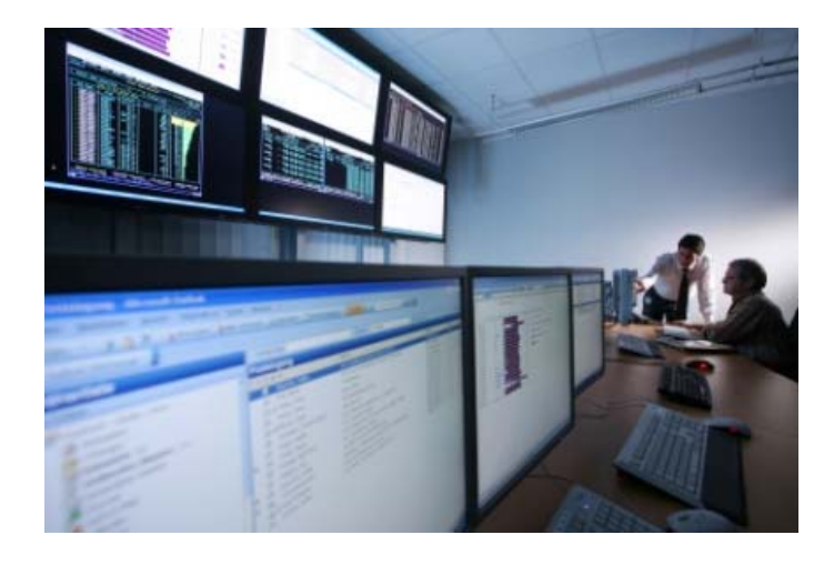
We shape Europe's future economy